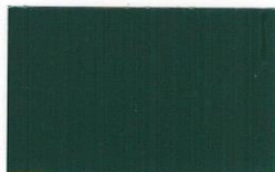
Emerald Green SR .26 E .87