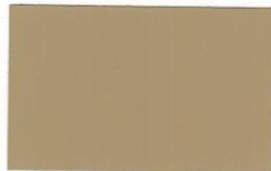
Sahara Tan SR .41 E .86