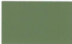
Patina Green SR .35 E .86