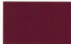
Barn Red SR .28 E .86