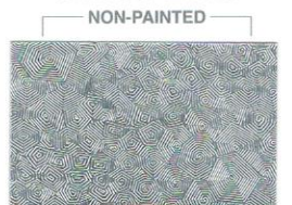
Galvalume SR .69 E .06

Colors shown on this chart may vary slightly from actual metal products.